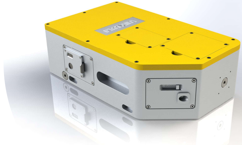
Vertical-external-cavity surface-emitting laser (VECSEL) a.k.a. Optically pumped semiconductor laser (OPSL)